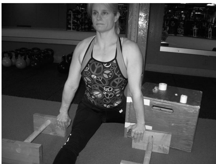
Figure 2. Staged test protocol position. Note the flexed rear leg holding the shank vertical to control pelvic alignment. A ruler is shown near the anterior superior iliac spine, which is identified by a white piece of tape.

Following each trial, the subject was asked to rate the pain she felt while in the lowest split position from 0 to 10. The pain scale was described as 0 indicating no pain and 10 as the worst pain she had ever felt. Both trial pain scores were recorded to obtain evidence regarding whether the subject varied her motivation across