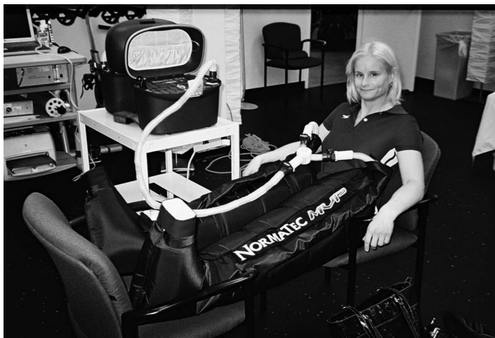
Figure 1. Experimental condition using the peristaltic pulse dynamic compression leggings. Note that the leggings are inflated and applying circumferential pressure to 5 cells along the lengths of the legs.

shank placed vertically against a matted gymnastics block. The rear leg position helped prevent the turning of the pelvis in the direction of the rear leg via passive insufficiency of the rear leg hip flexors (30,40–42). In addition, the subjects were coached to achieve a pelvic position that was as “square” as possible. The “square” position refers to the idea that the frontal plane of the pelvis is perpendicular to the sagittal plane positions of the forward and rearward legs. Once the subject was as low as she could go (ischial tuberosity closest